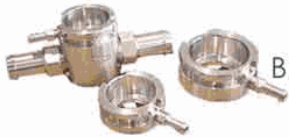
Billet Filler Necks