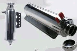
Overflow/ Recovery Bottle