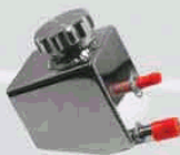
Power Steering Pump Reservoir