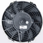
SPAL Fans/Davies Craig Fans